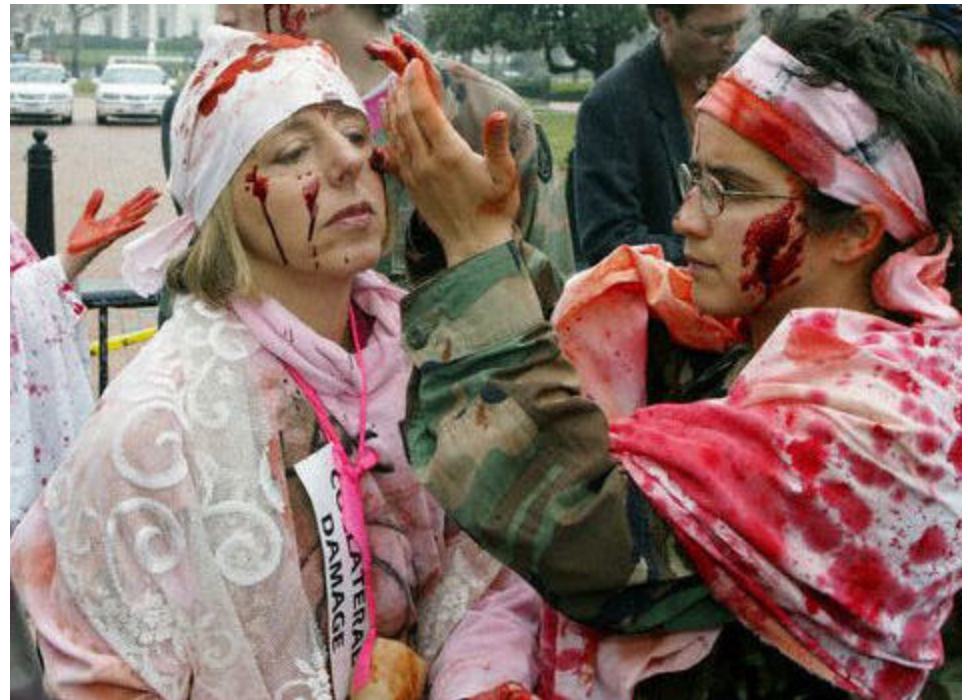
Waving the bloody shirt: anti-American activist Medea Benjamin (left) in costume as “collateral damage” of U.S. imperialism. The publicity gimmick involving fake blood was part of a Code Pink protest near the White House in March 2003.

Code Pink is selective in its criticism. The group condemns only American institutions, particularly the military. Rather than