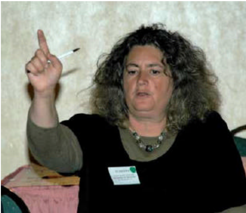
Code Pink co-founder Starhawk at the United for Peace and Justice National Strategy Conference in Chicago in 2003