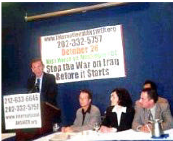
Former Attorney General Ramsey Clark announces ANSWER's plans for marches in Washington and across the U.S. to protest any attacks on Iraq