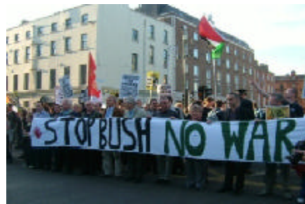
Anti-American protests marred President Bush's visit to Ireland

The Bush trip turned Ireland into an armed camp. The turnout of 50,000 protesters in Dublin forced Irish security officials to transform the Shannon area into what the press called a "ring of steel." Six thousand officers (the "largest in the history of the island," according to the Washington Post ) were deployed; naval gunships patrolled an estuary and armored cars searched bogs and alleys. Some of Ireland's top lawyers signed a petition suggesting the President be arrested as soon as he arrived. Clerics openly questioned his morals. The leader of the Irish Senate boycotted an embassy dinner.