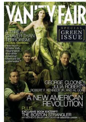
Al Gore's media relations strategy has been highly effective.

watch a video comparing your commitment to solving the climate crisis to the World War II Normandy landings, the civil rights movement, and putting a man on the moon.