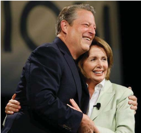
Gore and Speaker of the House Nancy Pelosi (D-California) embrace July 19 at the Netroots Nation (formerly YearlyKos) bloggers' convention in Austin, Texas.

selection of the content.” Current Media said in a filing with the SEC.