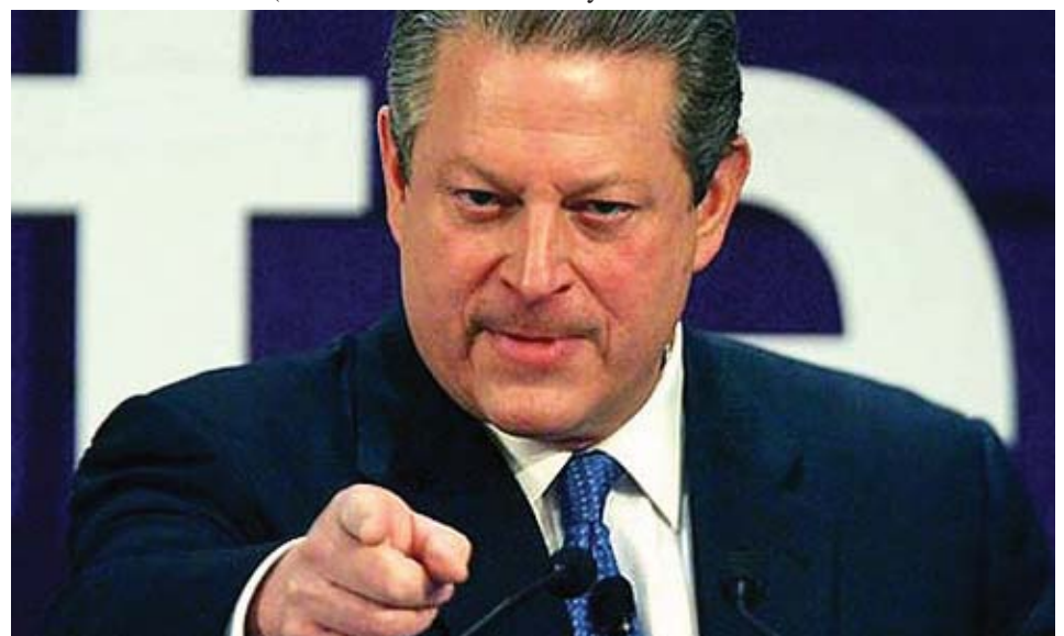
Gore, who frequently bristles at the observation that his environmental goals and business interests intersect, is shown delivering a speech at a UN climate change conference in Bali in 2007.

For the moment the carbon offsets traded on CCX are of questionable market value because no one is required to purchase them. CCX has 80 corporate members that are repentant carbon emitters. They have committed to voluntarily reduce their carbon emissions by the year 2010 to 6% below what they were in 2000. The members include