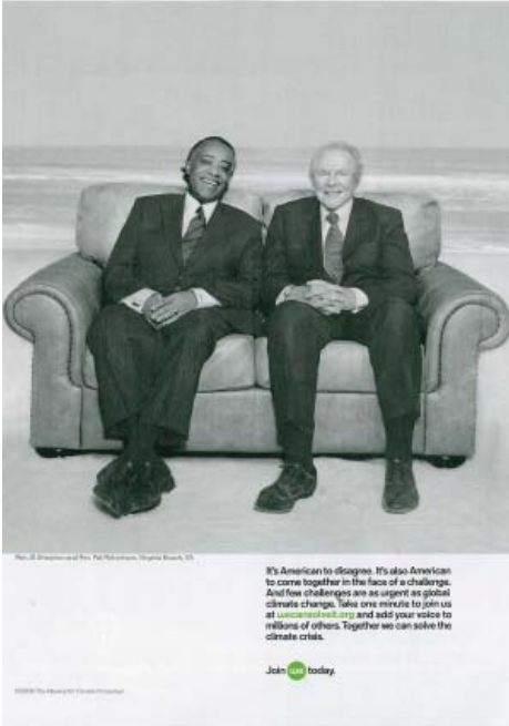
An Alliance for Climate Protection magazine ad

“It’s too simple to say that. It’s just too simplistic. Generation’s success is not based on a cap and trade system in the U.S.,” Campbell said. “I don’t think you can read anything into Al Gore’s campaign to make people understand the severity of the climate crisis for the last few decades with the performance of the fund management business that he chairs.”