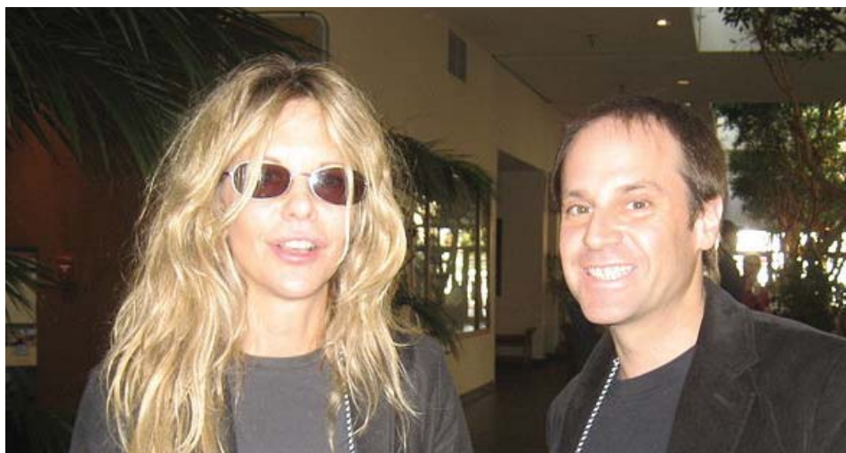
Shown with actress Meg Ryan (left), Hollywood mogul Jeffrey Skoll (right) is a Gore business partner who helped finance An Inconvenient Truth .

technology and policy solutions with the greatest potential to help solve the current climate crisis.” While the two firms have similar goals, GIM focuses mostly on public equities, while Kleiner Perkins focuses on startup or expanding companies that haven’t gone public yet. In May, GIM announced that it had raised $683 million for a “Climate Solutions Fund” which it closed to further investment.