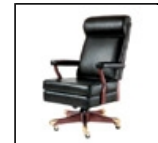
Lavalina-Edition Oval Office Chair