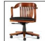
"Bank of England" Swivel Chair