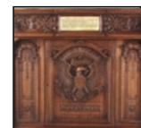
H.M.S. Resolute Desk